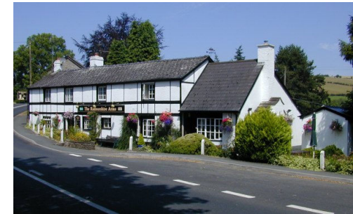
^ The Radnorshire Arms, Beguildy

Beacon Hill (547 m) can be climbed straight from the cottage with fantastic views from the top. Offa's Dyke path passes nearby, and the Offa's Dyke Centre is in Knighton for information and an exhibition about the Dyke.