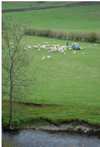
< The scene from Rose Cottage's sun room