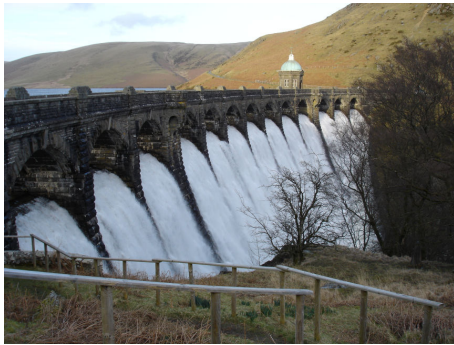
The Elan Valley >