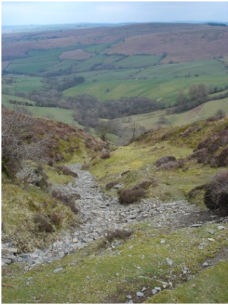
< The view on Beacon Hill